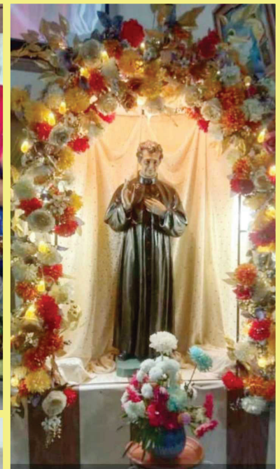
Novena in honour of St. John Bosco