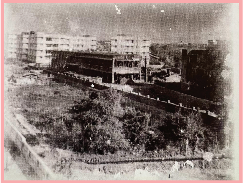
Aspirants and staff of the St. Paul's Apostolic School.

The school that began with 13 boys in Standard VIII and 30 in Standard IX is proud today to have well-nigh 2000 students on its records in 4 sections - Pre-Primary, Primary, Secondary and Junior